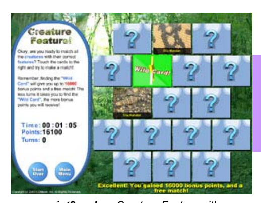
point2explore Creature Feature with Standard Customization

Value Added Customization: Our games and programs can also be customized beyond the standard customization. From background images and button designs to custom functionality, the customization options are just about endless. We can utilize supplied images. We can design a custom look to compliment existing designs. We can even add functionality to the code. Utilizing Value Added Customization gives you the ability to develop an affordable and custom multimedia software program.