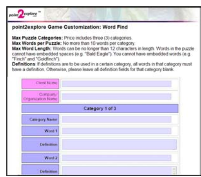
point2explore's online customization form

We have made the customization process very simple. Customers will receive web links to instructions and simple online forms to enter the data in the correct format. Simply submit a form for each game you have purchased and we will implement your data into the game or program.